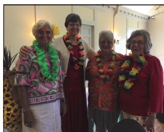
Grayson Valley CWC Birmingham, AL