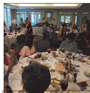
Shelby County CWC Hoover, AL

Once again, thank you for your kind words, encouragement, sweet notes, prayers, buying and giving books and even financial support for Giving Thanks Ministries. Your acts of kindness lift me to keep on keeping on. I am truly blessed.