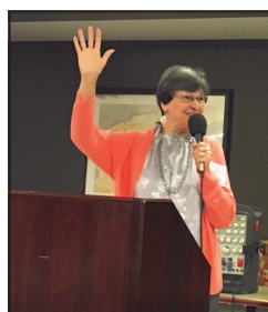
Sylacauga After 5 Sylacauga, AL