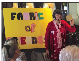
Marietta CWC Marietta, GA

Four Christian Women Connection groups invited me to share my journey with their members and visitors. The groups are dear ladies who desire for their friends and neighbors to know Jesus. With one group I shared "Fabric of Friendship;" with the other three I shared "Does Your Life's Journey Have Purpose."